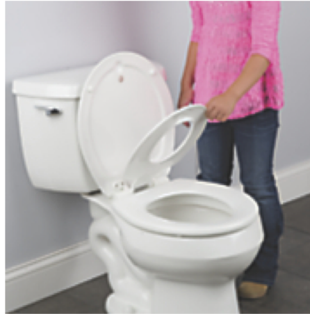
Disappearing Toilet Seat