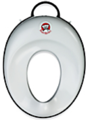
Baby Bjorn Toilet Trainer Seat