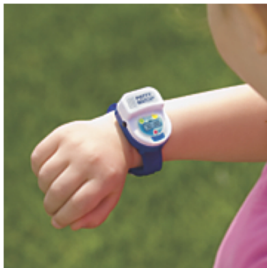
Potty Time Watch