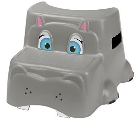
Kids Squatty Potty